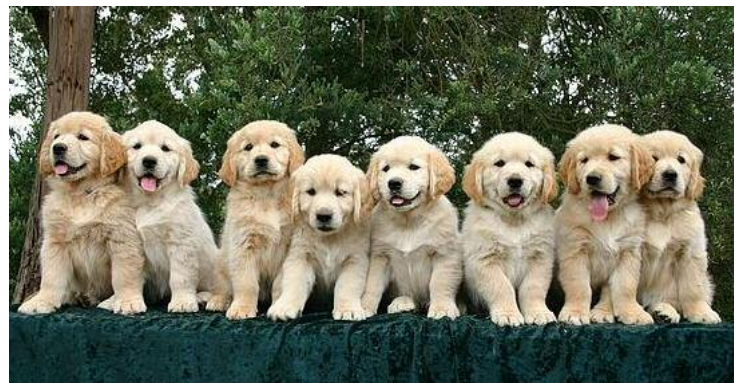
Teagan's puppies born on 10 December 2003