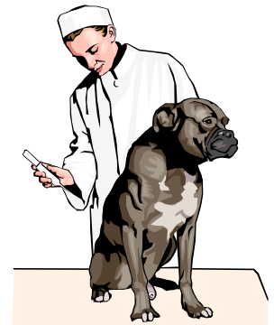
There are different types of vaccines for your dog

The newer types of MLVs, the recombinant vector vaccines take the genetic code for key immunogenic proteins and insert it into a non-pathogenic organism such as pox virus or herpes virus.