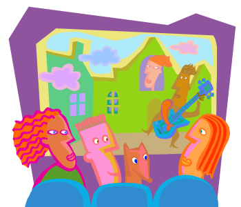
The Intellectual Dog

"Yes, I'm amazed as well," came the reply. "He hated the book."