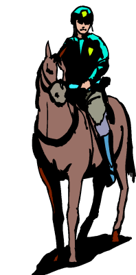
Do the Right Thing!

It was immediately clear that this person had never cleaned up after their dog before, because he picked up the poo in his open hand and placed it in the bag!