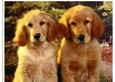
Quinn and Rocky are Assistance Dogs Australia trainees

Rocky and Quinn get a break from jail when they spend weekends at a prison officer's home, where they mix with other dogs and play with children.