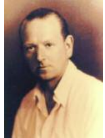
Dr Edward Bach

Remedies are readily available from most health food stores and pharmacies.