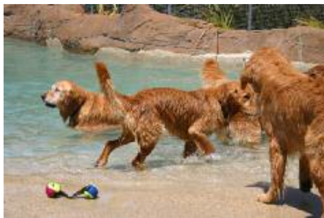
Fun at Kepala Canine Country Club!

We all eat too much at Christmas time, but this year my family outdid ourselves! We decided to eat out for Christmas lunch and four courses later we were totally defeated! We weren't able to even cook our planned bar-b-que dinner— and there were no nibbles or treats that afternoon! We had to