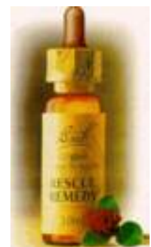
Bach Rescue Remedy

Star of Bethlehem is for all forms of trauma.