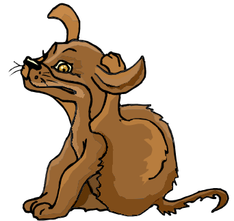
Constant scratching could be caused by an allergy

Contact Allergies Contact allergies occasionally occur from reaction to a chemical such as a disinfectant or cleaner.