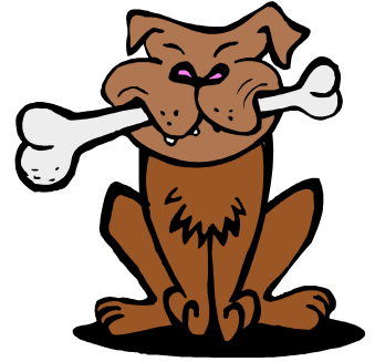
Reward your dog for good behaviour

Reward the simple behaviours that you've been taking for granted! Open your eyes and open your treat bag! What you reward is what you'll get!