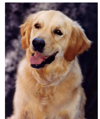
Tully T Ch Fernamber Tradition Tracking Dog of the Year for 2002!