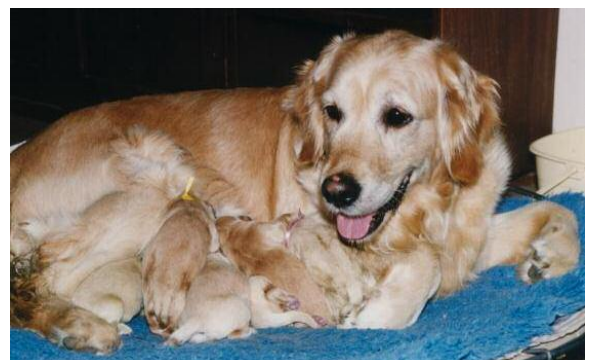
Teagan and her puppies on the day they were born.

Meg, Fernamber Tambourine was awarded fourth place in a retrieving beginners test in November. A week later she was awarded a qualifying certificate (QC) in retrieving in