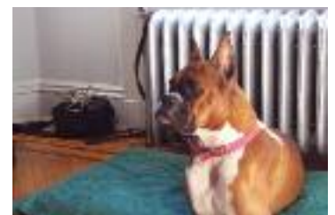
Tir on her bed

This story really illustrates how clicker training helps our dogs to puzzle out solutions.