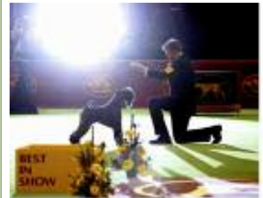
Best in Show

Rich in tradition the Westminster Kennel Club's famed annual dog show is a unique, prestigious event. Indeed there is only one Westminster.